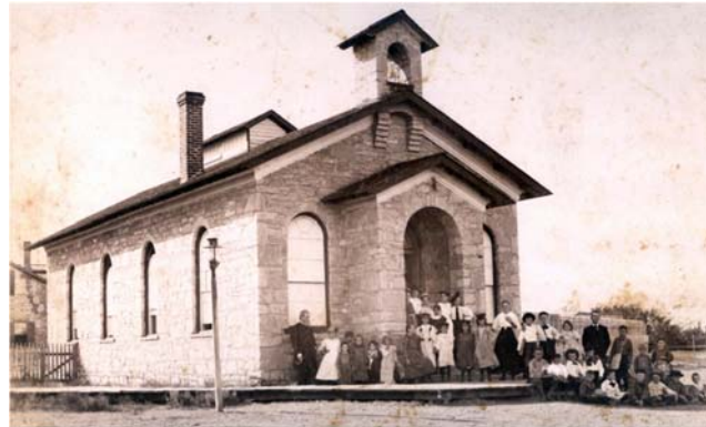
Old Post Chapel at Fort Sill, I.T. in 1896.

The Southwestern Oklahoma Historical Society records and documents the history of this area of Oklahoma. New material is always needed for publication from members and non-members alike, which will preserve the experiences of individuals from all walks of life.